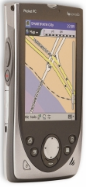
HP Journada 500 Series